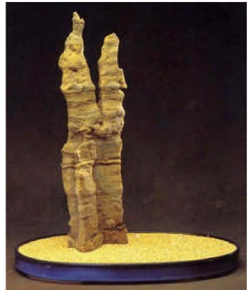
"Twin Peak in the Chinese Style" (Limestone)